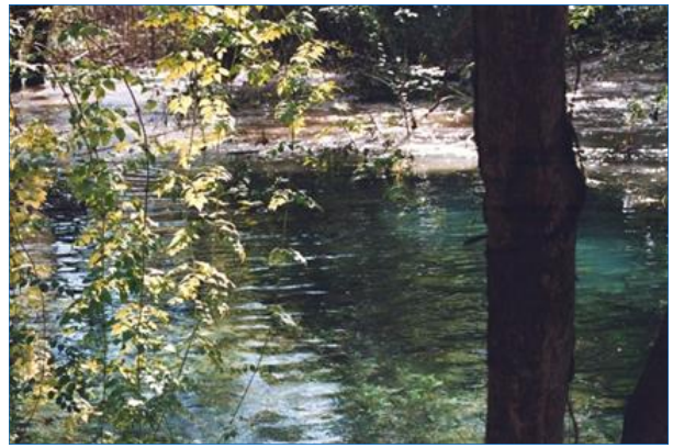
After the rains: Confluence of a muddy Olmos Creek with spring flows from the Blue Hole